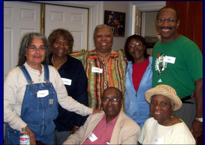
Participants of 3 rd Focus Group